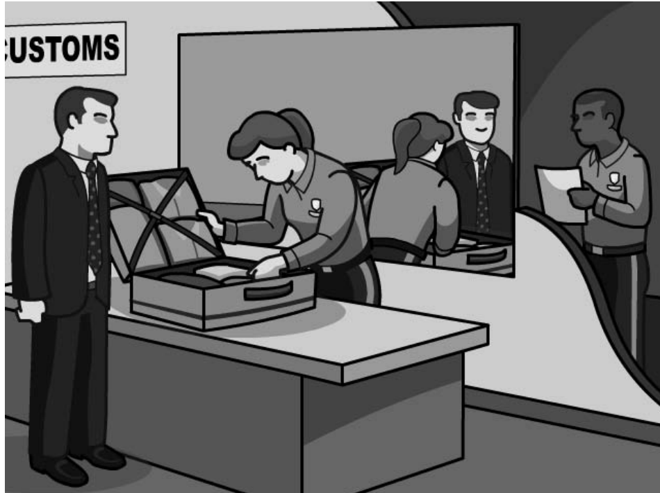
5. 1 Airport Security. Baggage Inspection