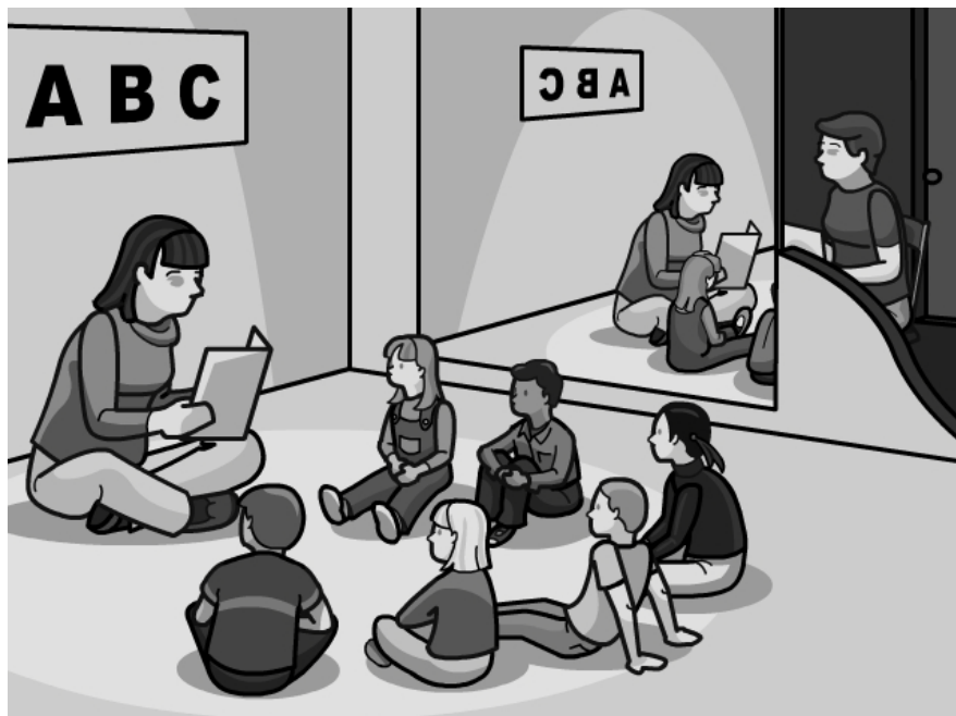
5.2 Day Care Center