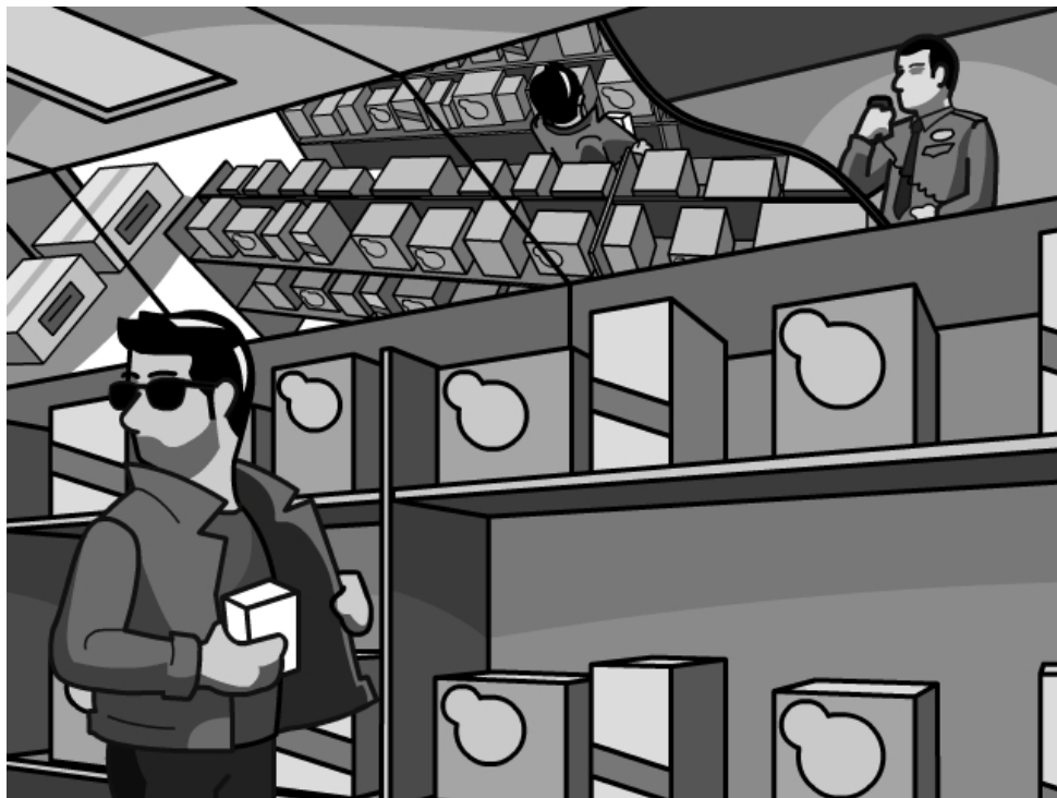
5.4 Retail Store Anti-Theft Monitoring